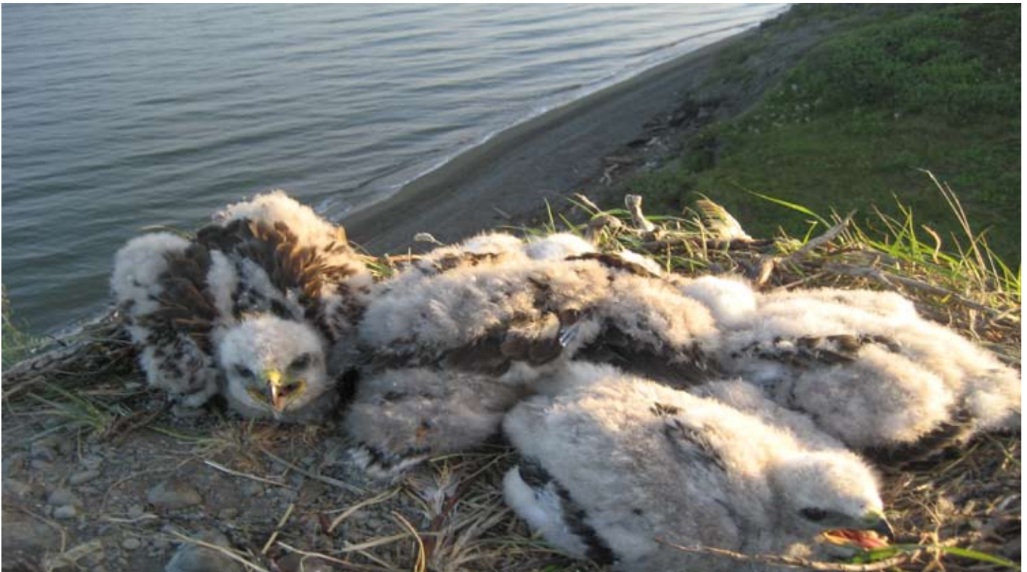
Raptor surveys on Herschel Island.

In 2010/2011 monitoring activities will continue to be conducted by Yukon Park Rangers along with the help of a Yukon Parks Conservation biologist and two university students.