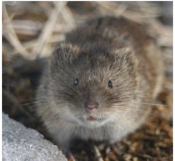
Herschel Island Tundra Vole.

Flip through the inside pages to see what projects the Council is recommending support for in 2010/2011.