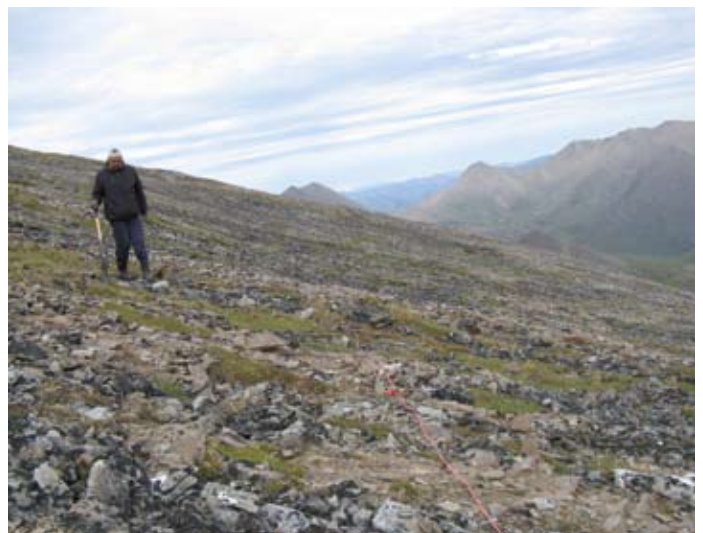
Billy Archie conducting grizzly bear denning field work.

A final report is expected sometime in 2011-2012.